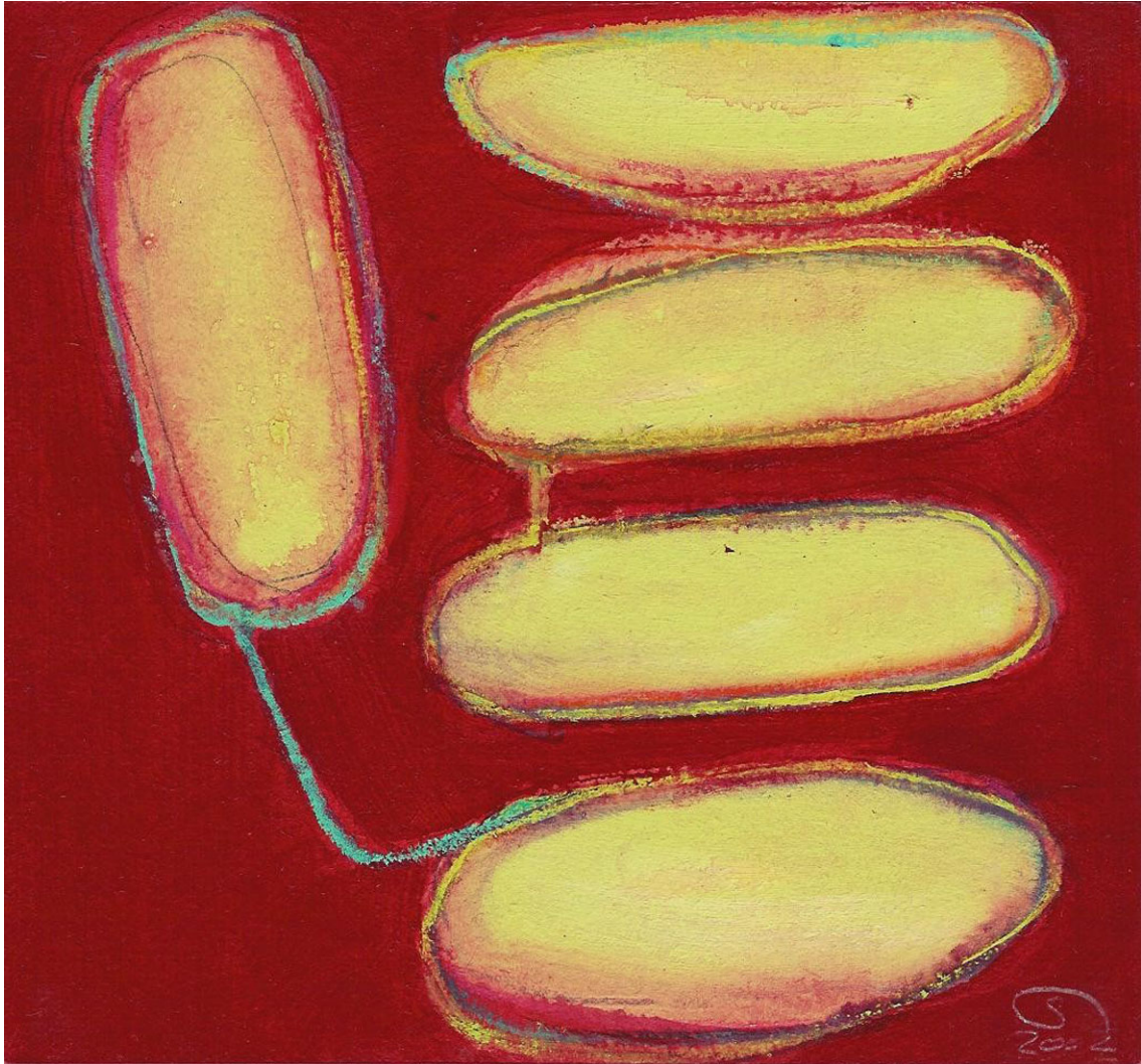
„ magic powder no. 22 „ mixed media on paper on wood 7 x 6 1/2 inches 2002