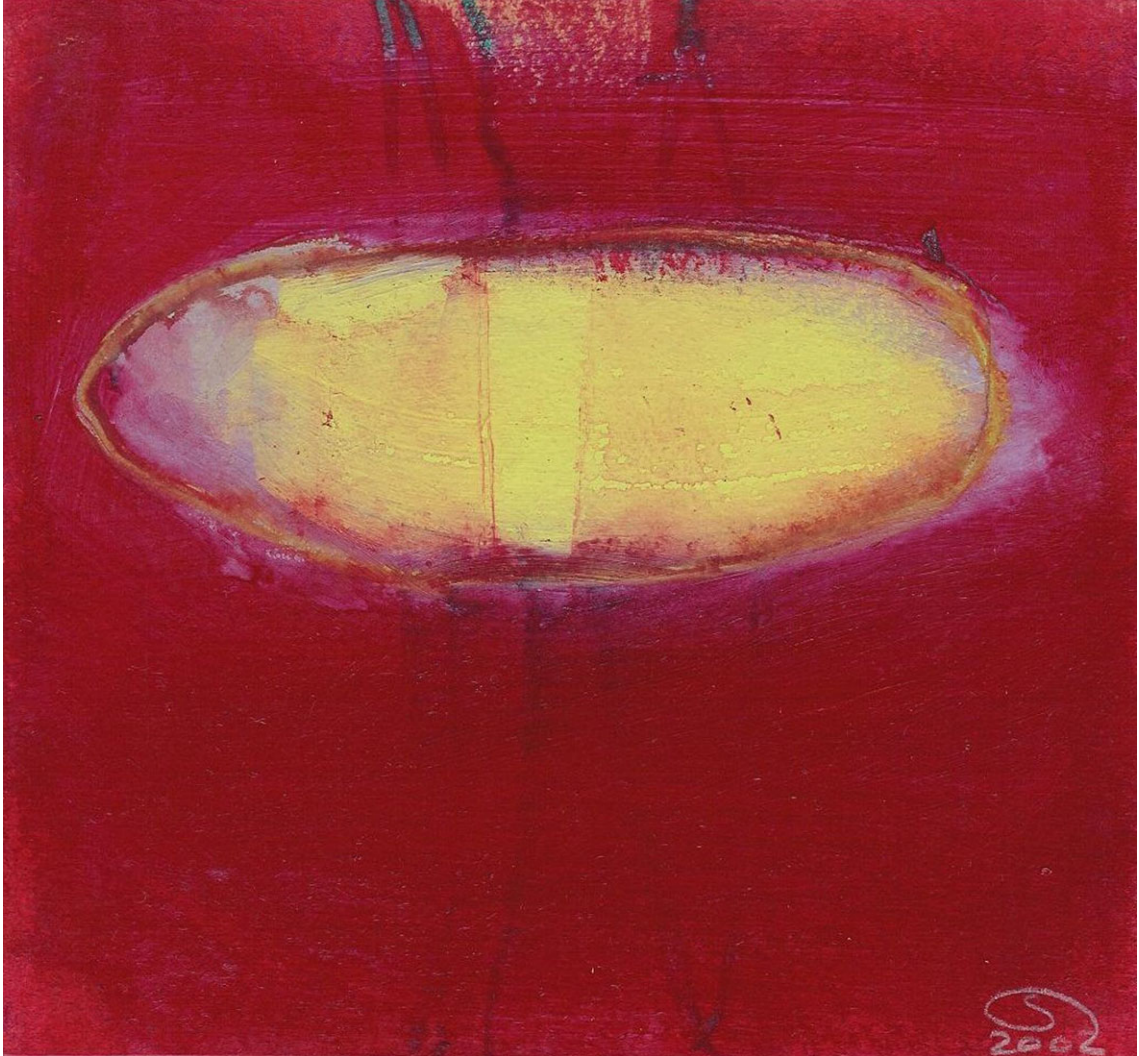
„ magic powder no. 4 „ mixed media on paper on wood 7 x 6 1/2 inches 2002 private collection Switzerland