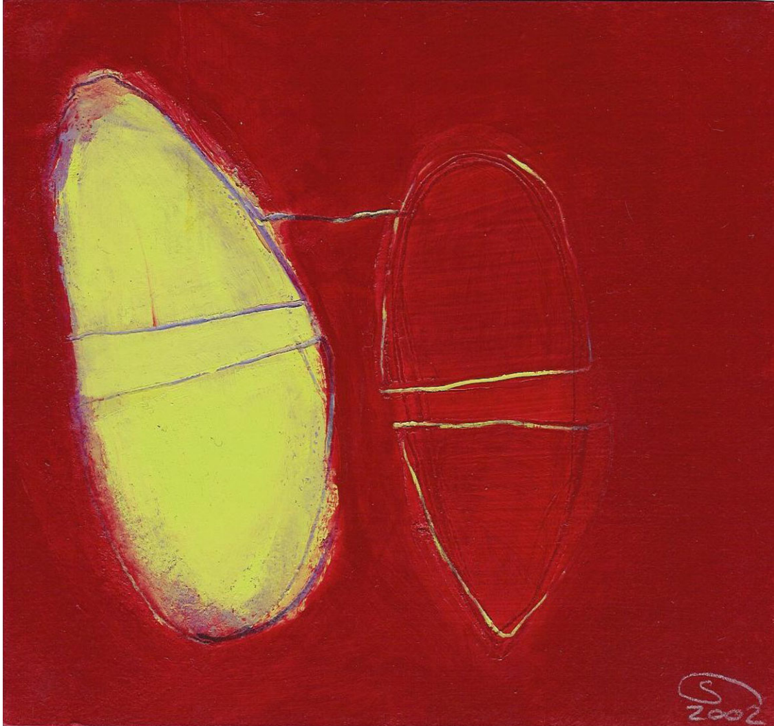
„ magic powder no. 12 „ mixed media on paper on wood 7 x 6 1/2 inches 2002