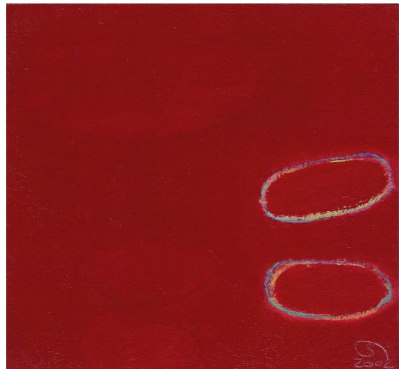
„ magic powder no. 14 „ „ magic powder no. 16 „ „ magic powder no. 17 „ „ magic powder no. 20 „ mixed media on paper on wood 7 x 6 1/2 inches 2002