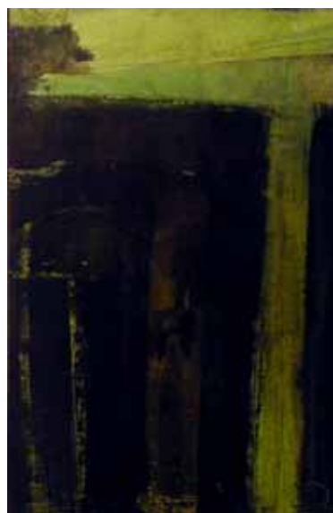
"growing" mixed media on paper on wood each 29.5 x 19.5 cm 2002