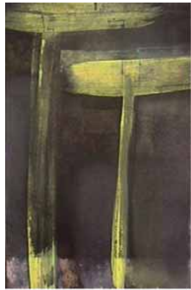
"growing" mixed media on paper on wood each 29.5 x 19.5 cm 2002