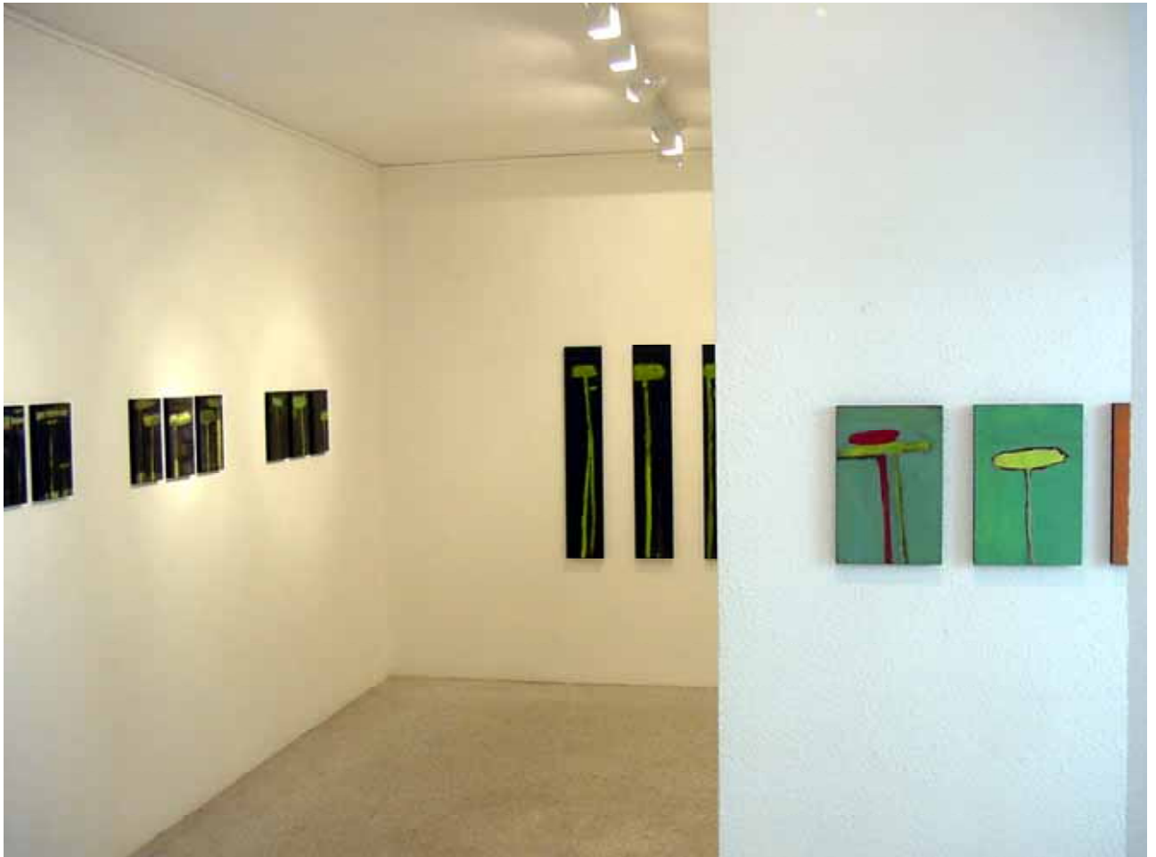
'growing' view of exhibition galerie ursula huber olten 2002